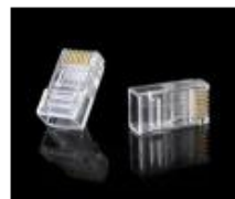
UTP CAT6E RJ45 8P8C