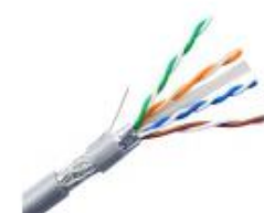
室内超六类铝箔+编织 双屏蔽网线 Indoor SFTP Cat6