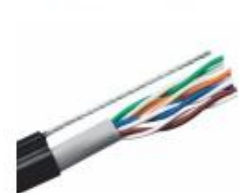
室外超五类网线+钢丝 Outdoor Cat5e+Messenger