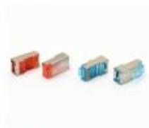
FTP CAT6E RJ45 8P8C