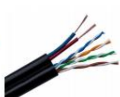
室外超五类网线+电源线 Outdoor Cat5e+2C