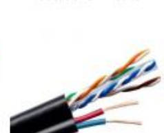
室外超六类网线+电源线 Outdoor Cat6+2C