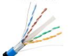
室外超六类铝箔屏蔽网线 Outdoor FTP Cat6