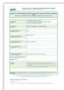
出口欧盟CE-CPN认证-网络超五类/超六类非屏蔽-网络超六类无卤 CE-CPN-Eco-Cat5e/Cat6 UTP-CCA/PVC