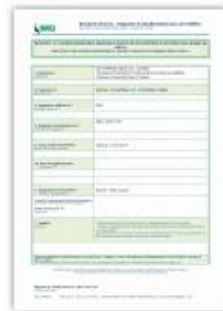
出口欧盟CE-CPN防火认证-网络电缆 (铜网) CE-CPN-Eco-Coaxial Cable(CCS)