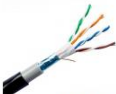
室外超五类铝箔屏蔽 防水网线 Outdoor FTP Cat5e