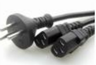
巴基斯坦头-二品字尾一分二 Pakistan-2x C13