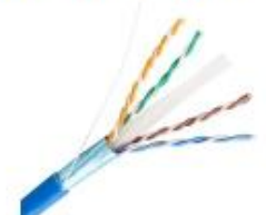
室内超六类铝箔屏蔽网线 Indoor FTP Cat6