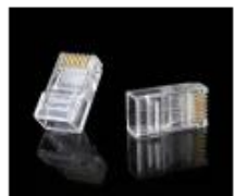
UTP CAT5E RJ45 8P8C