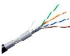
室外超五类铝箔+编织 双屏蔽防水网线 Outdoor SFTP Cat5e