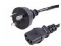
圆直头-品字尾 3 cores-C13