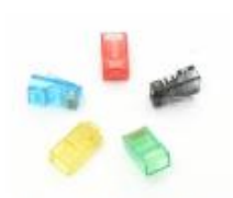
UTP CAT5E RJ45 8P8C