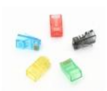
UTP CAT6E RJ45 8P8C