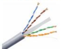
室内超六类非屏蔽网线 Indoor UTP Cat6