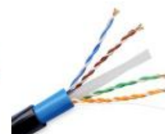
室外超六类非屏蔽防水网线 Outdoor UTP Cat6