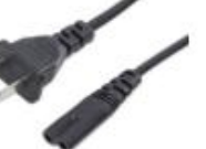
二芯美插头-八字尾 2 cores-C7