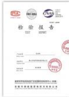
电话线 2x0.5mm检测报告/Telephone Cable