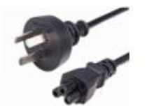
圆直头-梅花尾 3 cores-C5