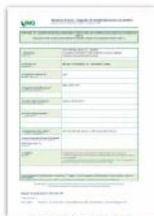
出口欧盟CE-CPN认证-网络超五类/超六类非屏蔽-网络超五类无卤 CE-CPN-Eco-Cat5e/Cat6 UTP-CCA/LSZH