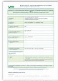
出口欧盟CE-CPN认证-网络超五类/超六类非屏蔽-网络超六类无卤 CE-CPN-Eco-Cat5e/Cat6 UTP-CCA/LSZH