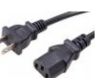
二芯美插头-品字尾 2 cores-C13