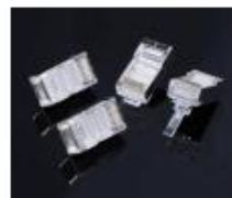
FTP CAT6E RJ45 8P8C