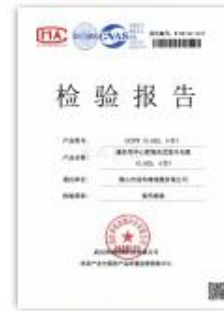
光纤光缆检测报告/Biber Optical Cable-GYTW