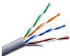
室内超五类非屏蔽网线 Indoor UTP Cat5e