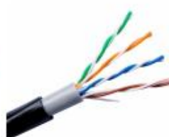
室外超五类非屏蔽防水网线 Outdoor UTP Cat5e