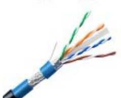
室外超六类铝箔+编织 双屏蔽网线 Outdoor SFTP Cat6