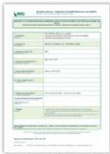
出口欧盟CE-CPN认证-网络超五类/超六类非屏蔽-网络超五类无卤 CE-CPN-Eco-Cat5e/Cat6 UTP-CCA/PVC