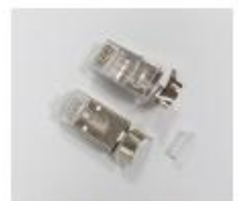
FTP CAT7 RJ45 8P8C