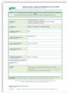
出口欧盟CE-CPN防火认证-网络电缆 (铜网) CE-CPN-Eco-Coaxial Cable(BC)