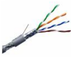
室内超五类铝箔+编织 双屏蔽网线 Indoor SFTP Cat5e