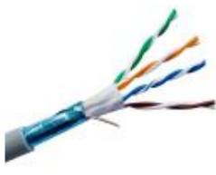
室内超五类铝箔屏蔽网线 Indoor FTP Cat5e