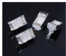
FTP CAT5E RJ45 8P8C